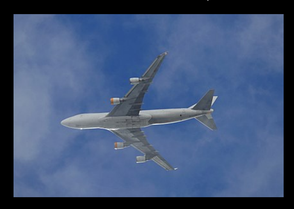
By kees torn (Jumbo Jet) [CC BY-SA 2.0] via Wikimedia Commons

Scientists have proposed that jets might save gas by mimicking a familiar pattern in nature. Geese conserve energy by flying in this iconic V formation, which reduces wind resistance.