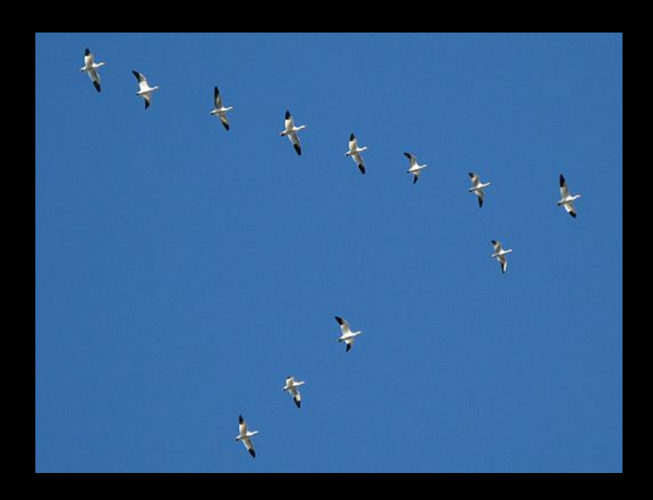
By Gilles Gonthier from Canada (Volée d'oies -- Flight of geese Uploaded by Amqui) [CC BY 2.0], via Wikimedia Commons