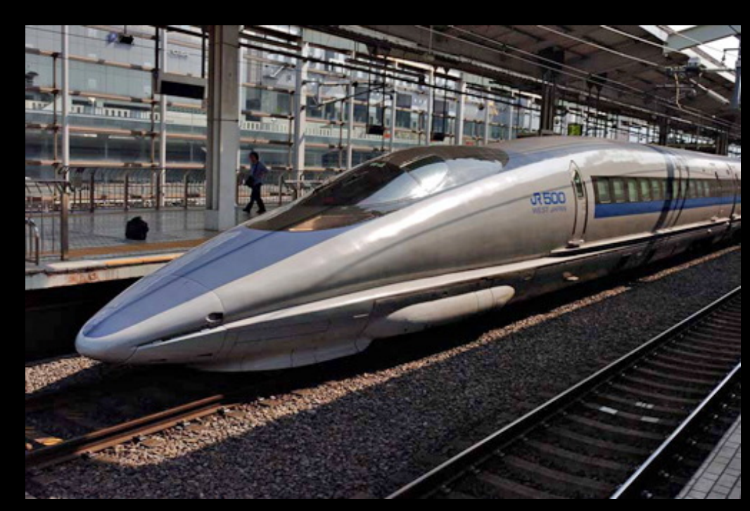
By Alok Mishra [Public domain], via Wikimedia Commons

When first designed, the Japanese bullet train made an ear-splitting sound as it emerged from a tunnel. Engineers found the solution to this problem in nature. The redesigned bullet train's nose was modeled on the shape of a kingfisher's beak. When kingfishers dive into water to catch fish, they are very stealthy so as to sneak up on their prey! Modeling the nose of the train in this way decreased noise issues while increasing efficiency.