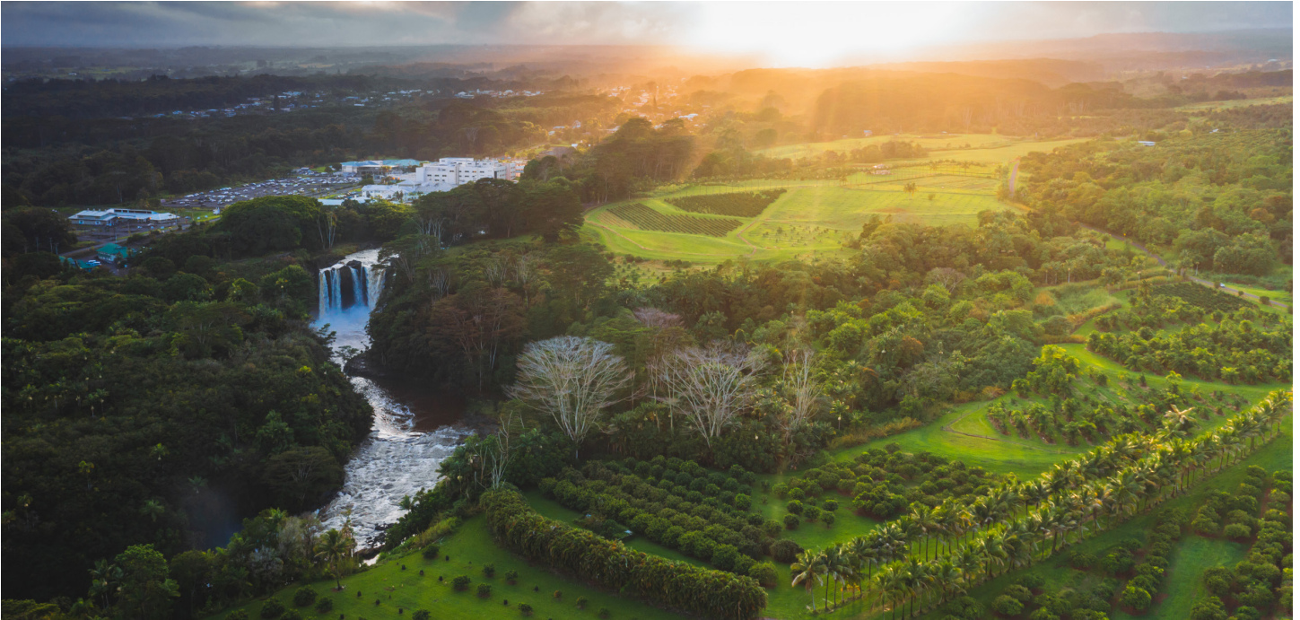
Agroforestry helps increase producer's income, while mitigating climate change. Agroforestry in Hawai'i

FOR PRODUCER PROFITABILITY AND CLIMATE STABILIZATION