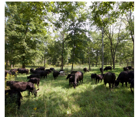
Silvopasture: Integration of trees and grazing livestock operations on the same land.