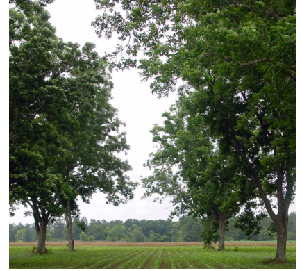
Alley Cropping: Planting rows of trees to create alleys where crops are grown.

This project will focus on the following types of agroforestry plantings: