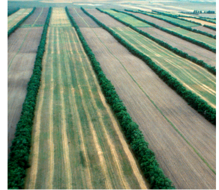
Windbreaks: Linear planting of trees and shrubs to reduce wind speed, preventing soil erosion, and protecting crops.