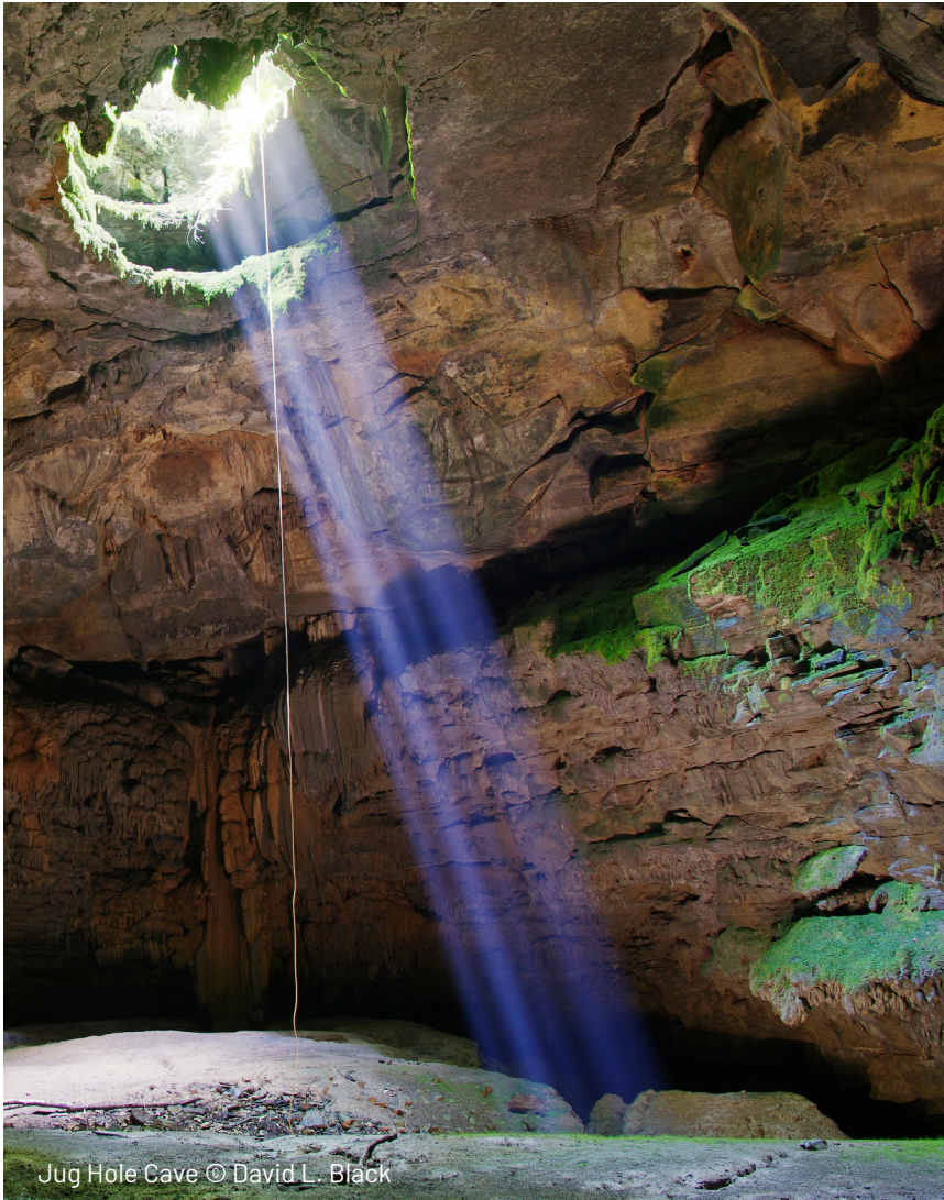
Jug Hole Cave