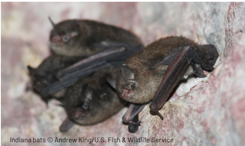
Indiana bats

Conservation banking is a market-based approach for conserving federally endangered or threatened species. Conservation banks restore and protect habitat, generating credits which can be used to offset adverse impacts to similar habitats elsewhere. The Nature Conservancy's (TNC) Bat Conservation Bank of Indiana permanently protects both overwintering habitat and summer maternal habitat for endangered Indiana bats and northern long-eared bats. Developers of renewable energy, transportation and similar projects can use credits from the bank to offset unavoidable adverse impacts to bats and their habitat.