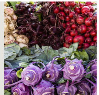
Produce from a sustainable farm

On Canada's prairies, there is a bond between Indigenous Peoples and the land, water, and sky. It's where Indigenous knowledge and community interests intersect with modern agriculture. Here, you'll find the Bridge to Land Water and Sky. We support this important initiative, focusing on helping First Nations overcome hurdles in the agriculture sector while integrating community values and Traditional Knowledge.