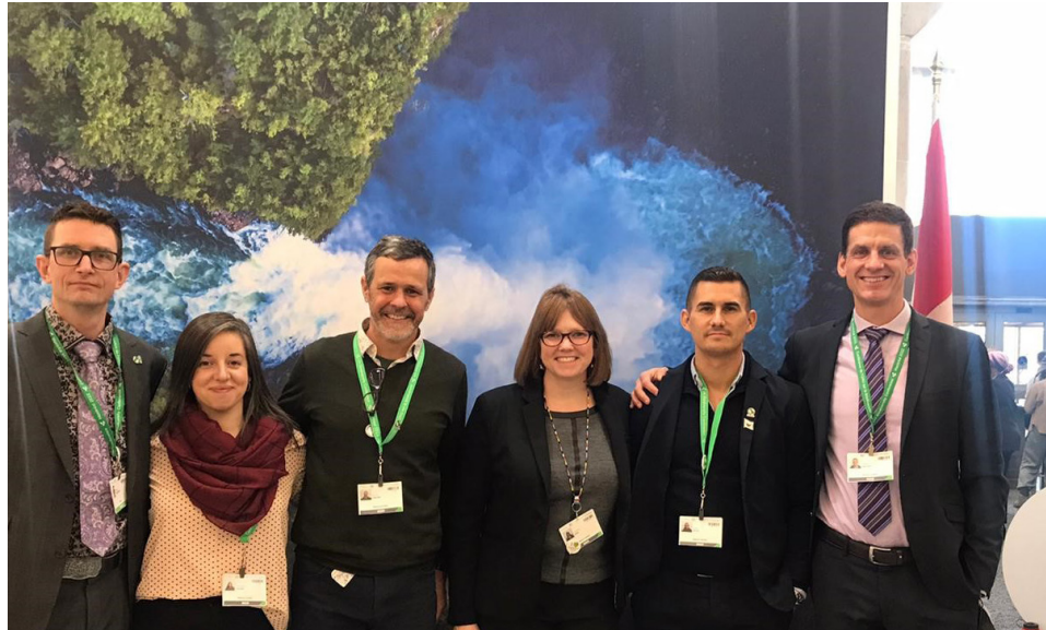
Our team at the COP15 United Nations Biodiversity Conference in Montreal in December 2022