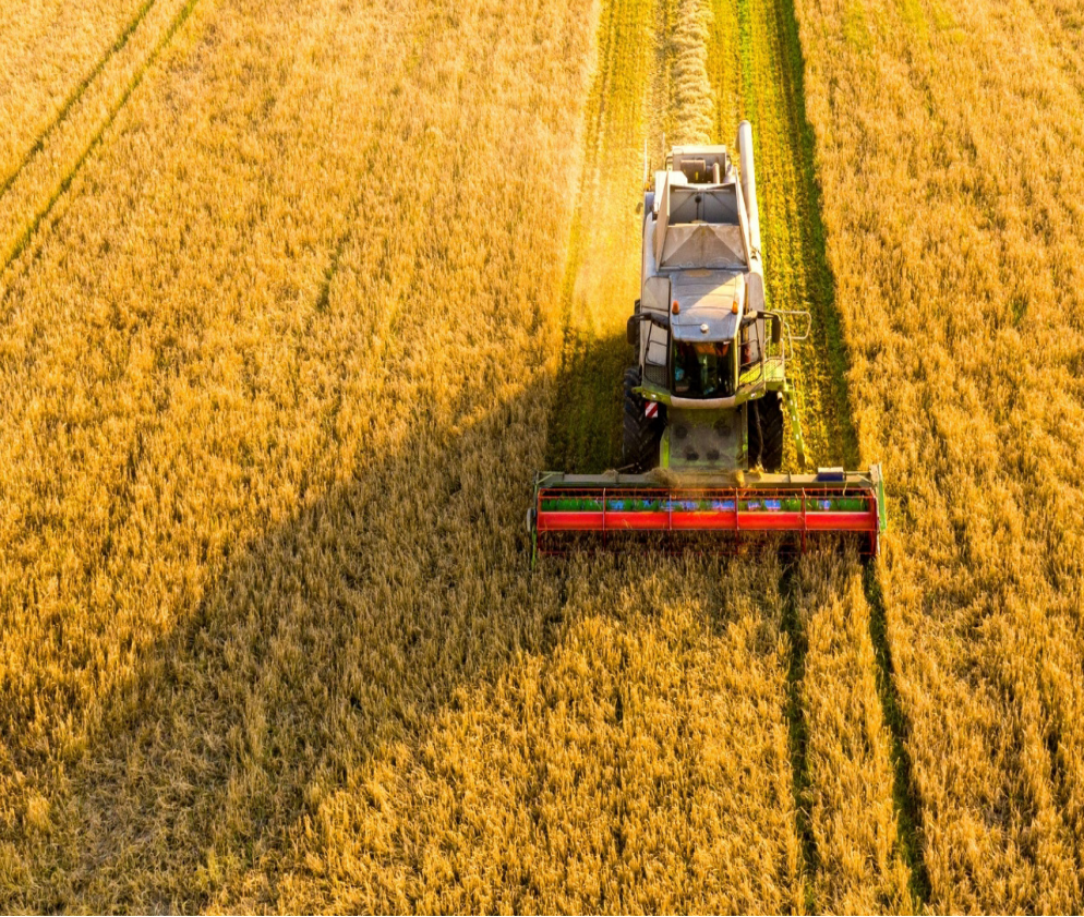
Alex Ugalek © Getty Images