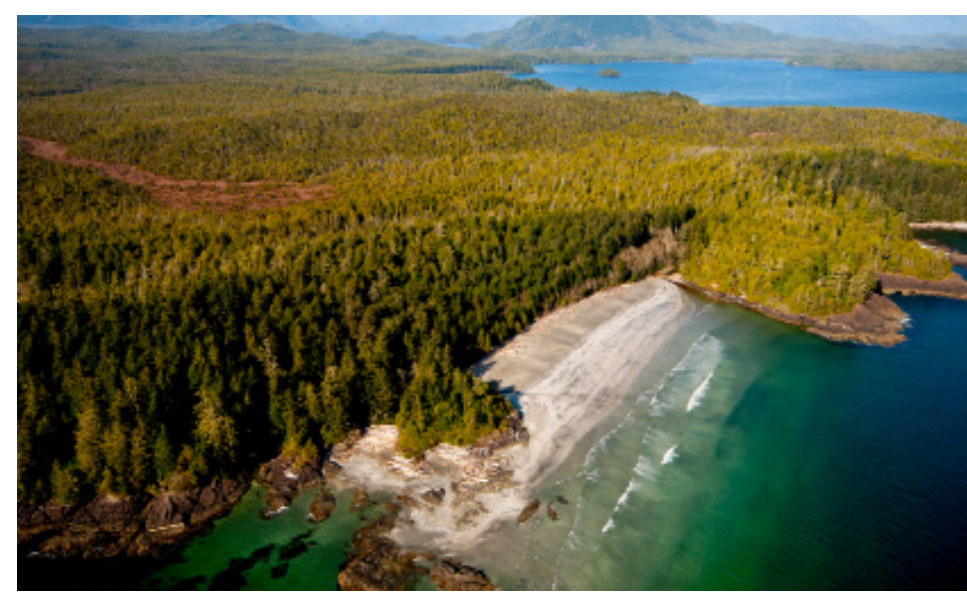
Old-growth forests on the homelands of local Indigenous Nations hold rich stores of carbon and biodiversity.