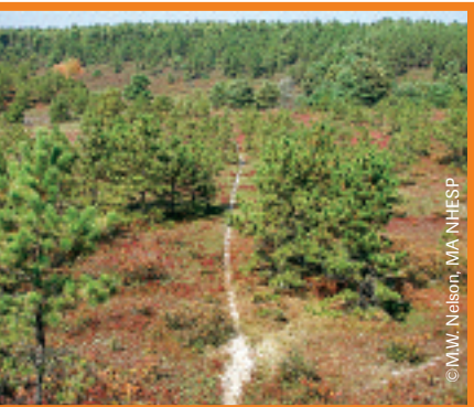
Frost Bottom in Myles Standish State Forest

Two of Earth's largest remaining pine barrens are found in southeast Massachusetts: one is found on and around Myles Standish State Forest in Plymouth, Carver and Wareham; and the other is located on and around the Massachusetts Military Reservation in Bourne and Sandwich. Both of these large forests feature a mosaic of pitch pine and scrub oak woodlands, with embedded ponds that harbor rare species and help protect the critical freshwater resources of this rapidly growing region.